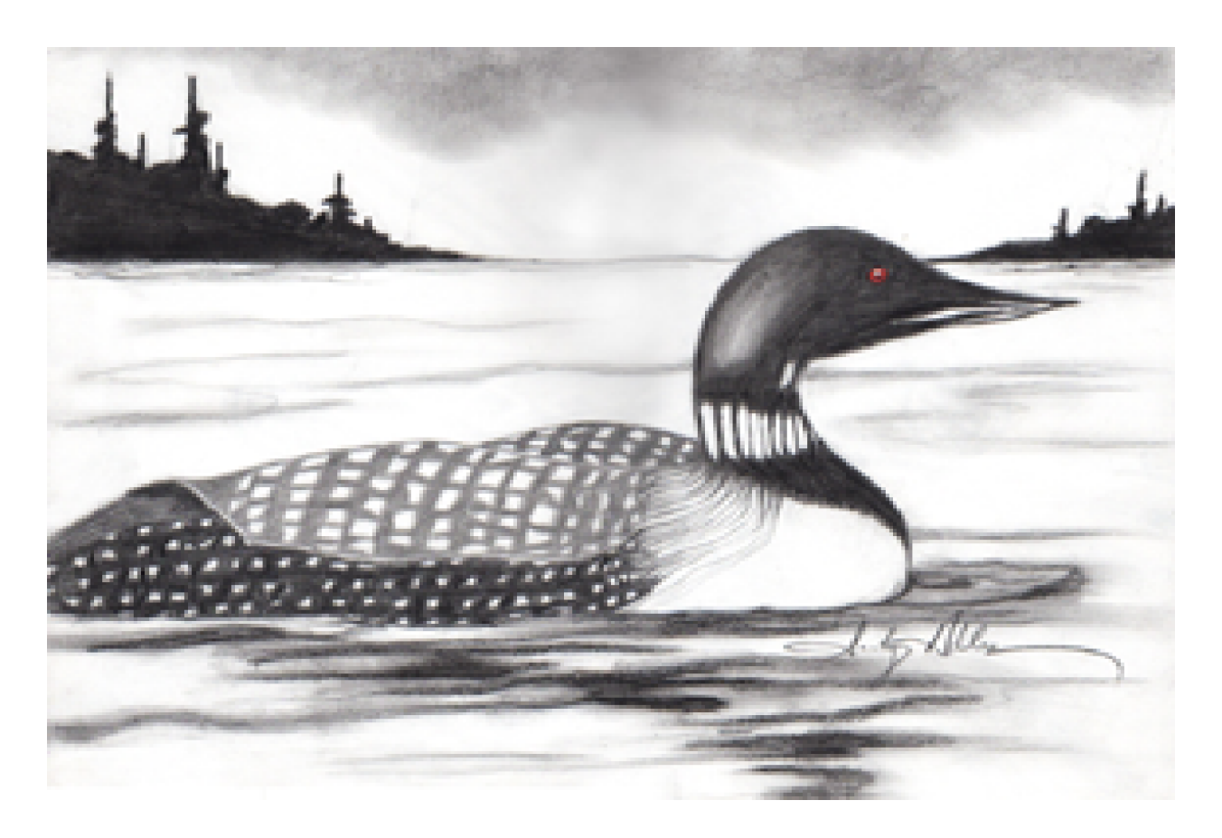
Negative & positive space to create contrast.

Capturing an object accurately using axis lines.