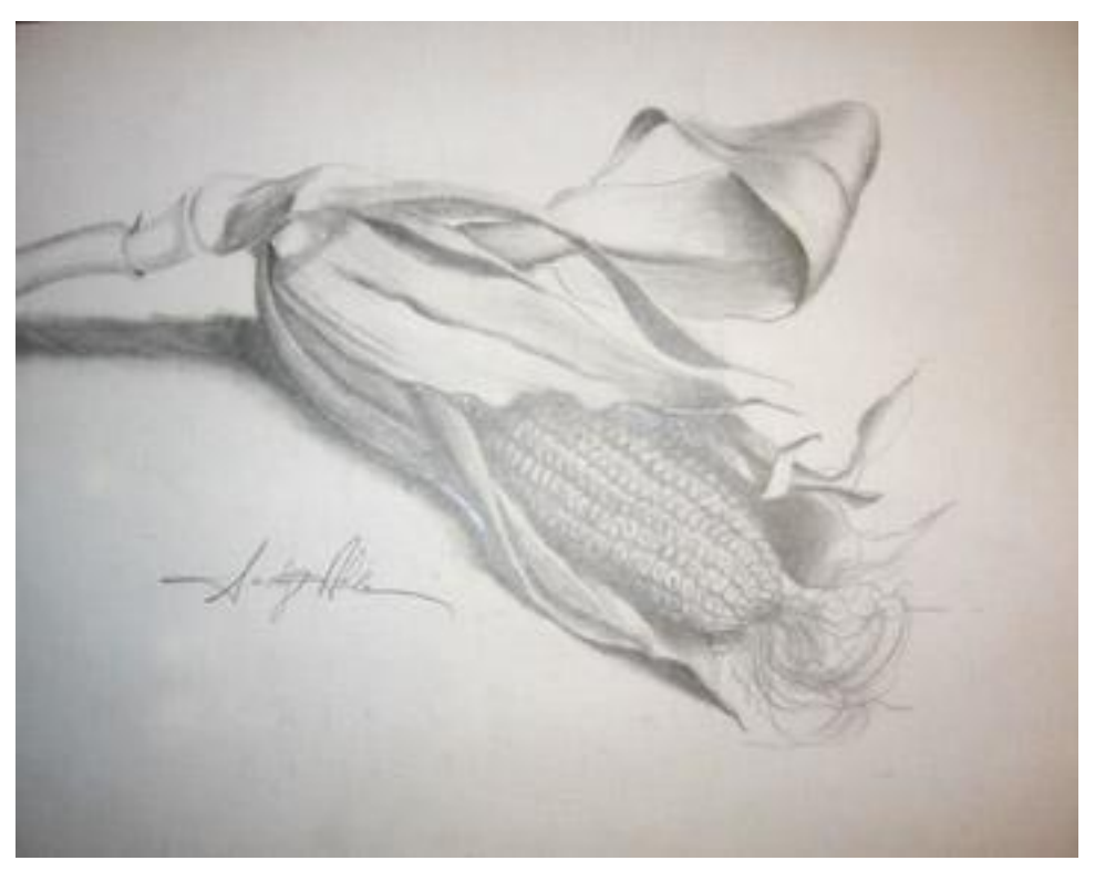
Simplifying a complex object using grid lines.