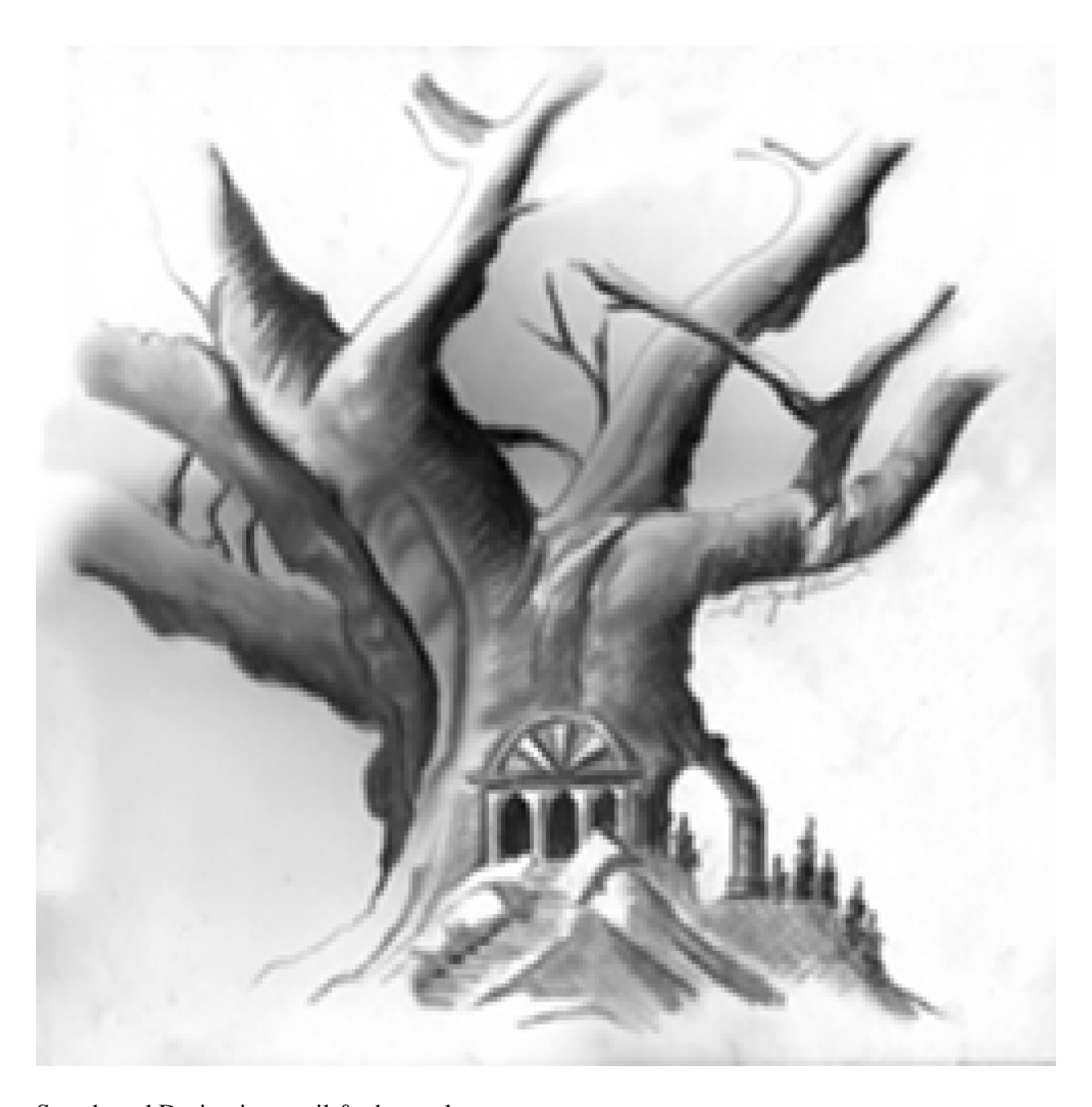
Storyboard Design in pencil & charcoal.