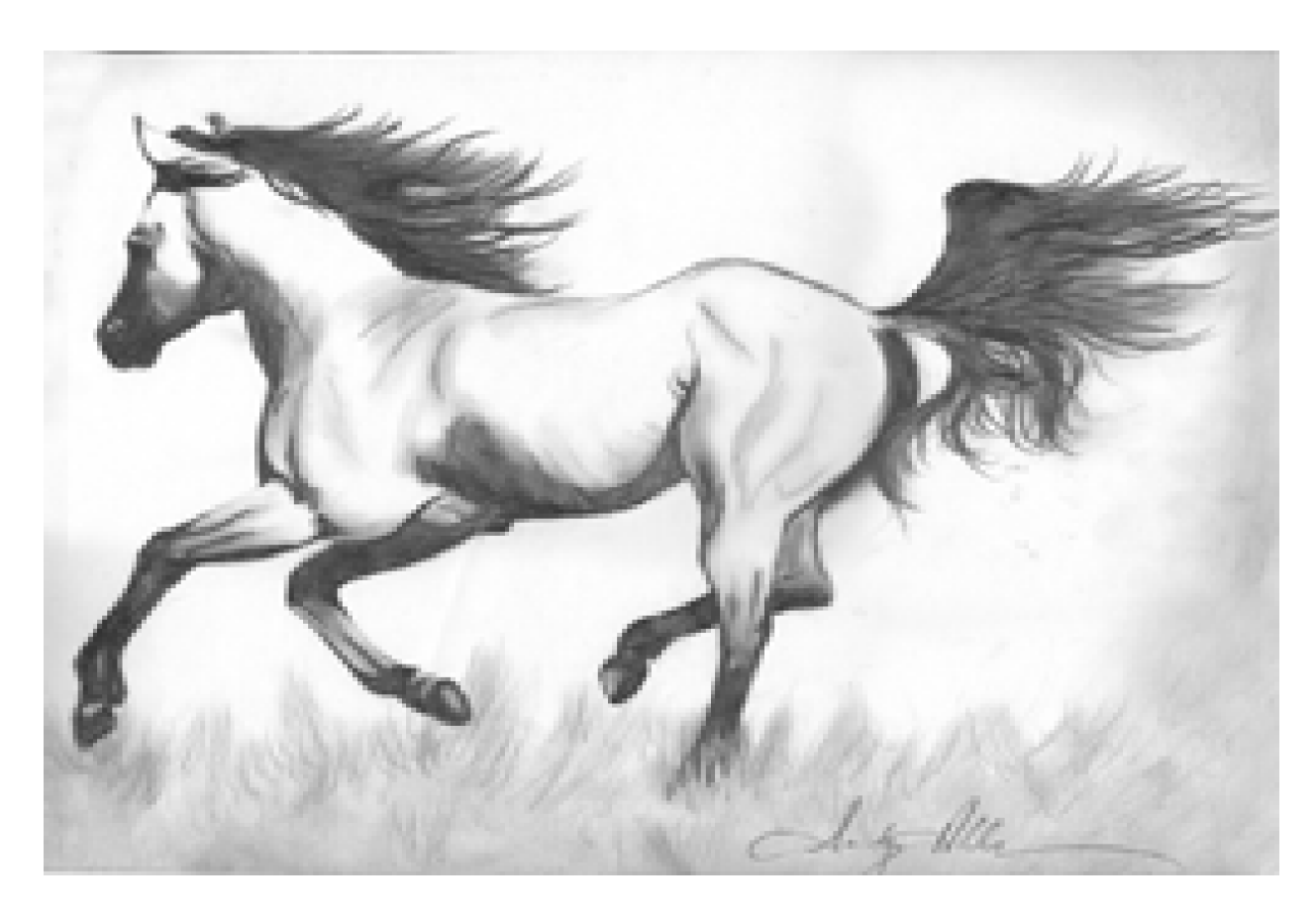
Graphing with pencil & charcoal.