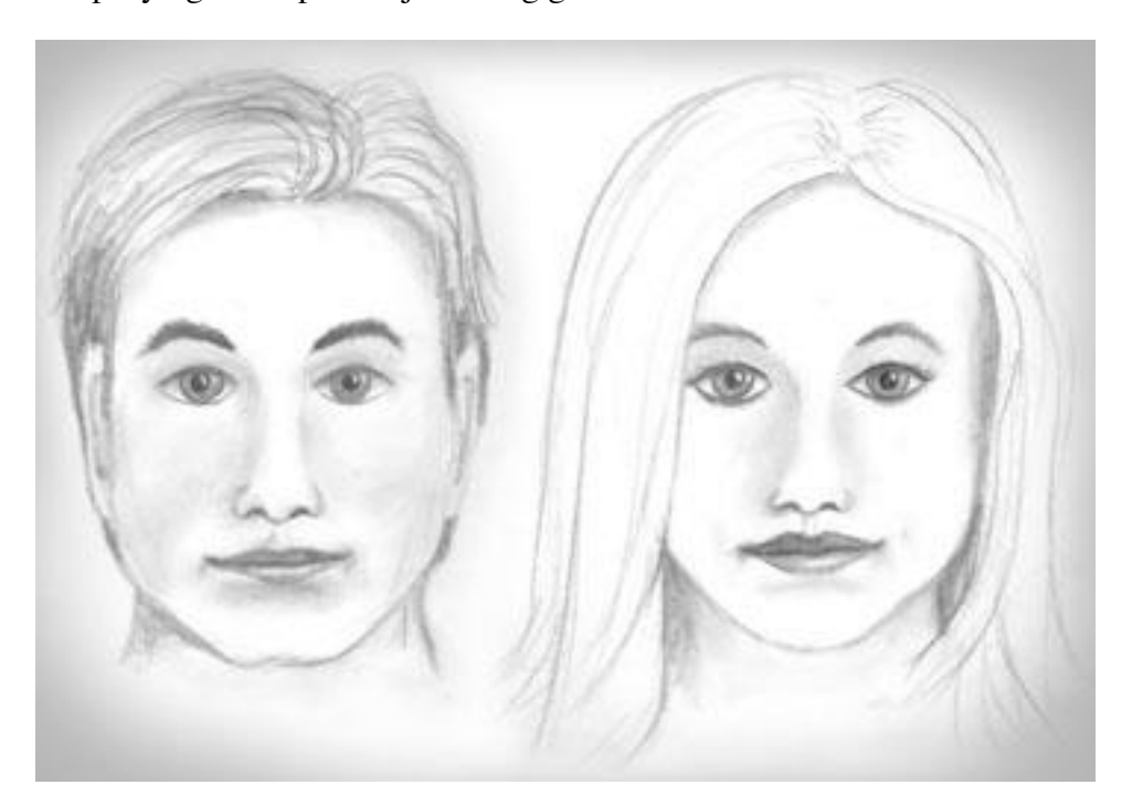
Introduction to the features & proportions of the human face.